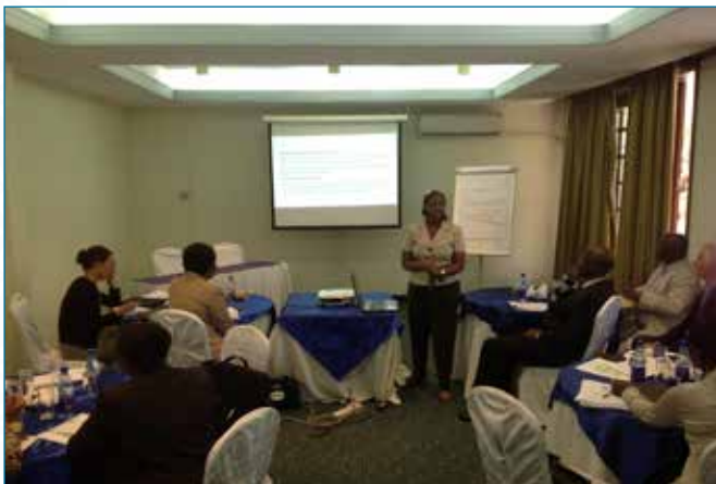
Participants during the ICGLR-RTF and UNWOMEN consultative and brain storming meeting in Nairobi, 21-24th October 2014.

In line with the way forward from the Nairobi Consultative and Brainstorming meeting, the OSESG-GLR approved USD 70,000 and signed a financing agreement on 14 th May 2015 to support a 'Symposium on Access to Justice and Fighting Impunity of SGBV'. The symposium was slated for 1-3 March 2016. Since the OSESG-GLR support could not cover the total costs of the symposium, the RTF planned to request the AU to meet the financing gap of US$ 37,100.