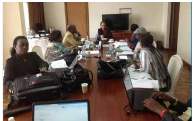
The RTF hosting the World Bank and ICGLR Mission to Kampala 25th June 2015