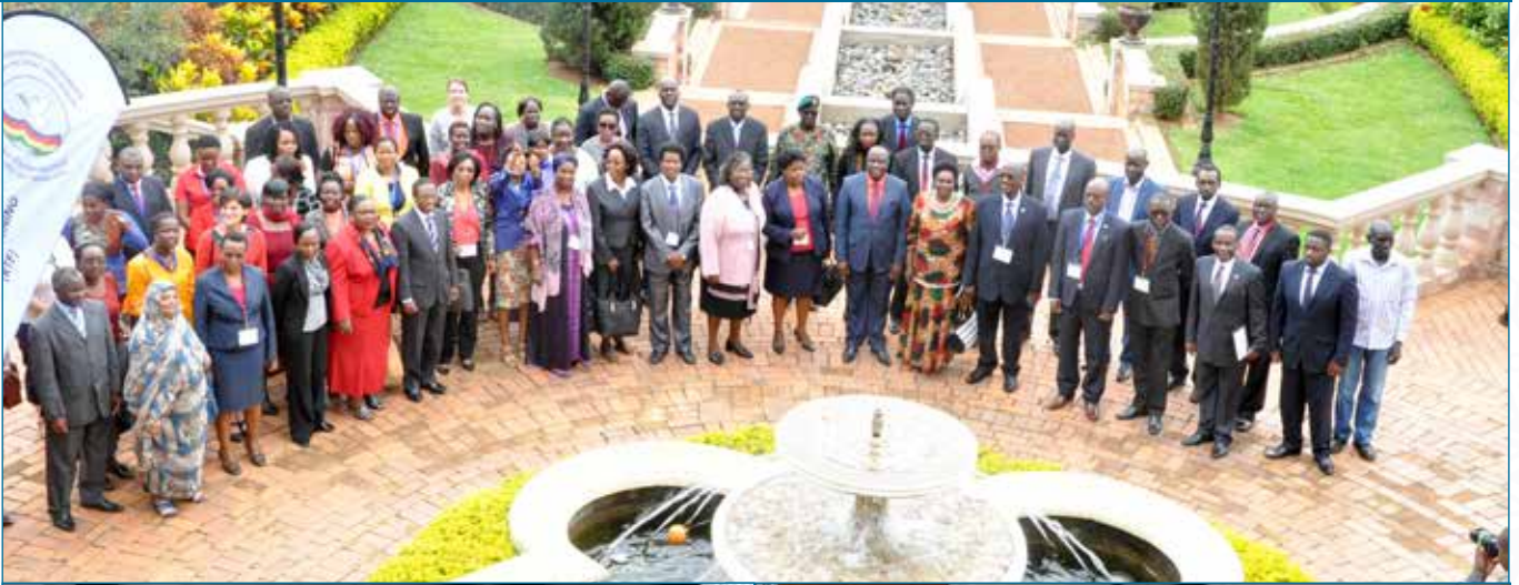
A Regional colloquium on Documentation, Investigation and Reporting of sexual violence in the Great Lakes Region, 5-6 th December 2016