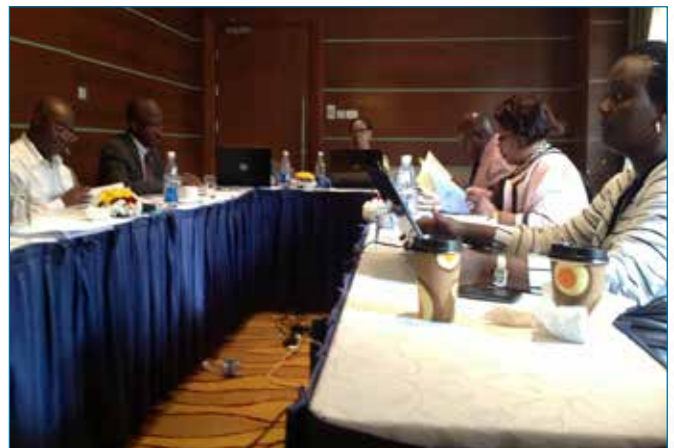
In one of the meetings to recruit staff for project implementation unit and the RTF accountant with Work Bank support.