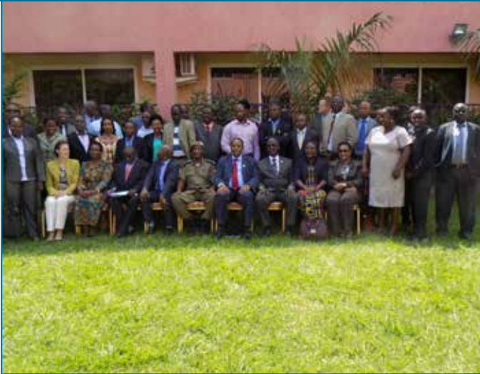
Training medical and Police Officers in Forensic Evidence Management, 9 th - 13 th December 2014