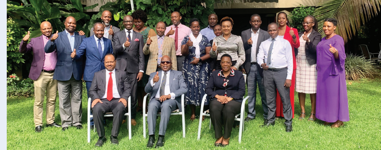
ICGLR Training workshop on Monitoring and Evaluation 2024