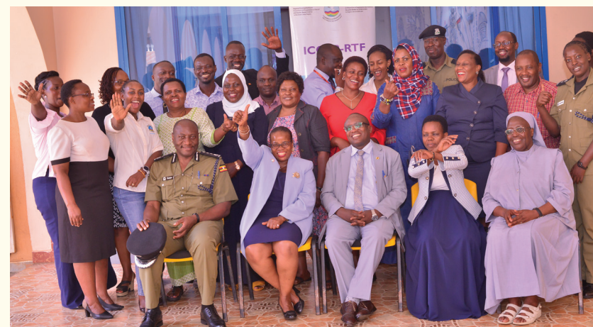
Representatives from different organizations during the Impact Assessment on the IntegraModel in Uganda 2023