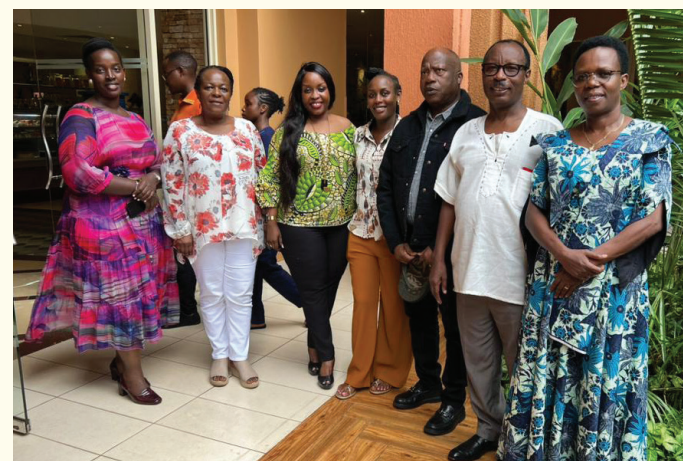
ICGLR-RTF Staff Meeting with the Executive Secretary at Serena Kampala Hotel on 1st May 2024