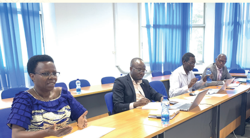
ICGLR-RTF Consultation Meeting with Burundi National Trainers on SGBV at the ICGLR Conference Secretariat in Bujumbura, Burundi on 19th April 2024.