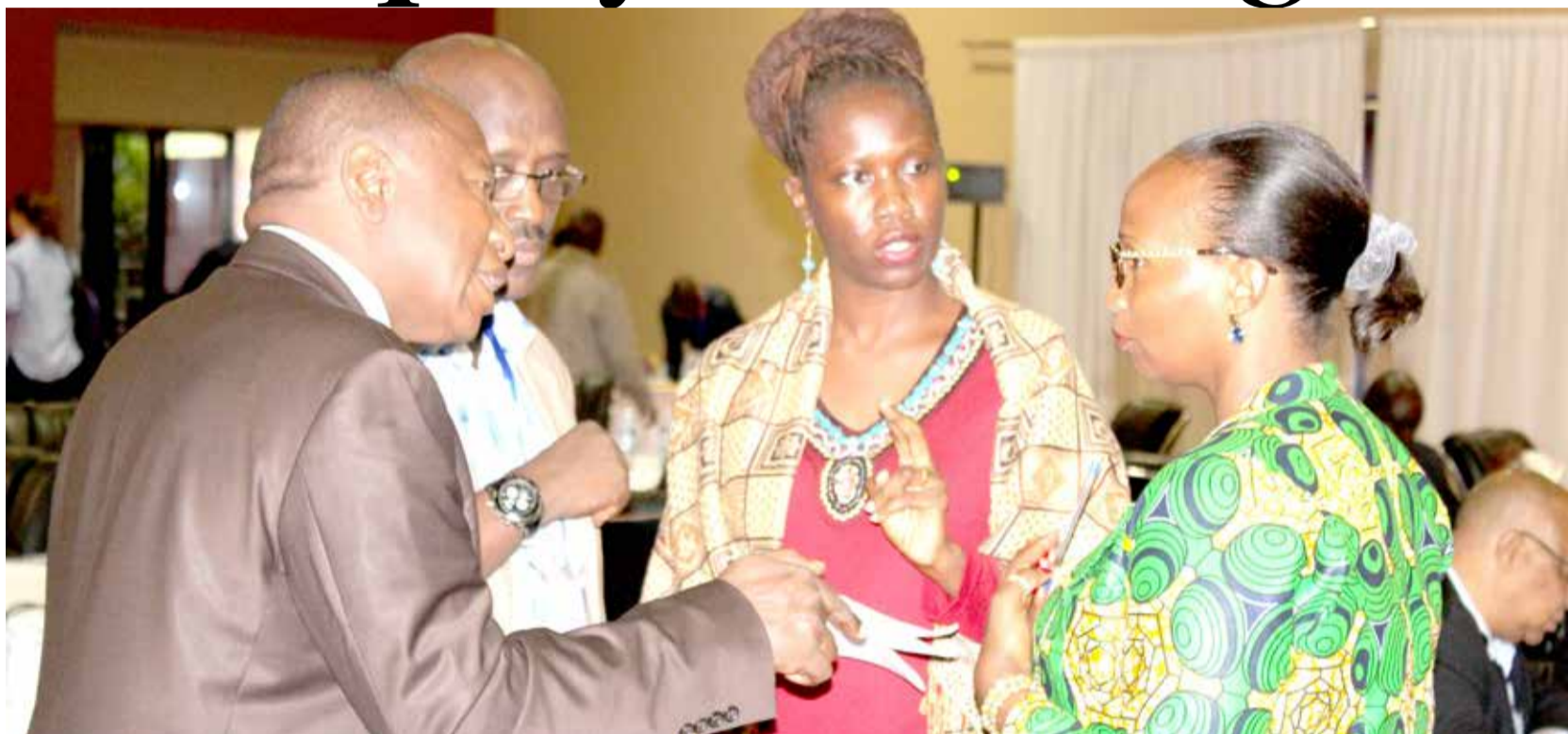
EQUAL REPRESENTATION: Delegates exchanging ideas at Munyonyo conference during the break.

According to the UN, financing for gender equality must include women's voices and eliminate discrimination by expanding their access to services, resources, opportunities, safety and security. Further it must enhance budget transparency and increase government and donor accountability.