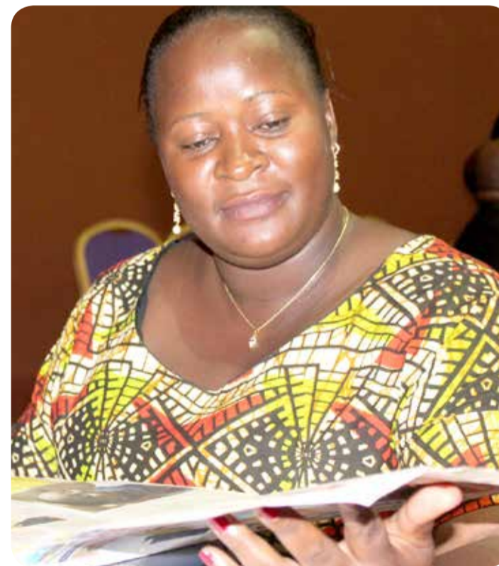
A Delegate reading a copy of The Great Region , the Conference Newspaper published by ICGLR -RTF with support from GIZ.

“There is evidence of promising legal and policy reforms to prevent and punish SGBV perpetrators but the gap between norm set-