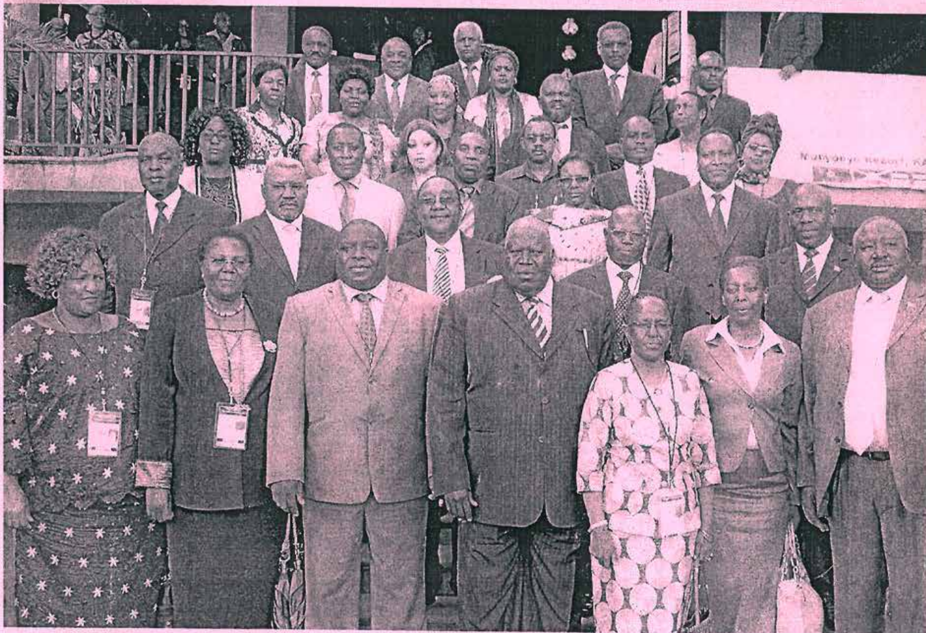
Delegates pause for group Photograph after the opening ceremony by Uganda's Deputy Prime Minister Gen. Moses Ali of the Regional Inter-Ministerial Committee at Munyonyo, Kampala on 13 th December 2011

“ United to end impunity and provide assistance to victims of sexual and gender based violence in the Great Lakes Region”