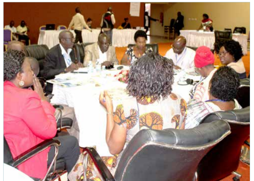
TOP AND BELOW: Delegates deliberating at Munyonyo Conference

"Our training (for the regional facility trainers) will design interventions based on the Socio-Ecological Model, which aims at changing multiple forces of a person's environment that may be perpetuating harmful