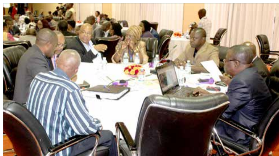
Participants during group discussions at Munyonyo

There have been strategies for the dissemination of SGBV instruments such as: Dissemination of the Law against Domestic