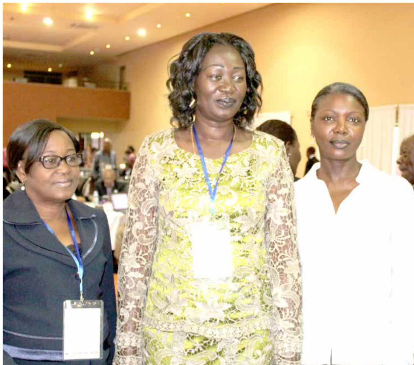
Hon Awut Deng Acuil (C), Minister of Gender and Child and social Welfare, South Sudan with other delegates at the RTF Kampala Conference on Sunday, December 3rd, 2017.

14. The objectives of the campaign are to raise awareness, reduce stigma from survivors and occurrence of SGBV cases within communities; initiate training programmes in school curricula; strengthen and implement the law to end impunity and improve the living conditions of victims and assist to