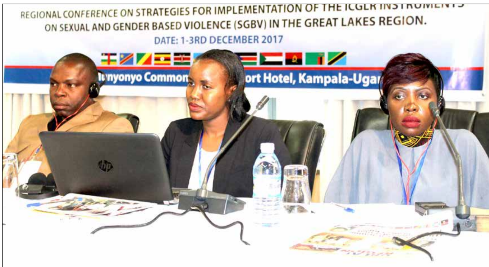
Delegates discuss the social relations between men and women, within the context of society at one of the sessions in Munyonyoi, Kampala

Conscious of the high prevalence and widespread incidence of sexual violence in the Great Lakes Region and its destructive impact on the lives, health, physical, sexual, psychological, social, and economic well-being of women and children;