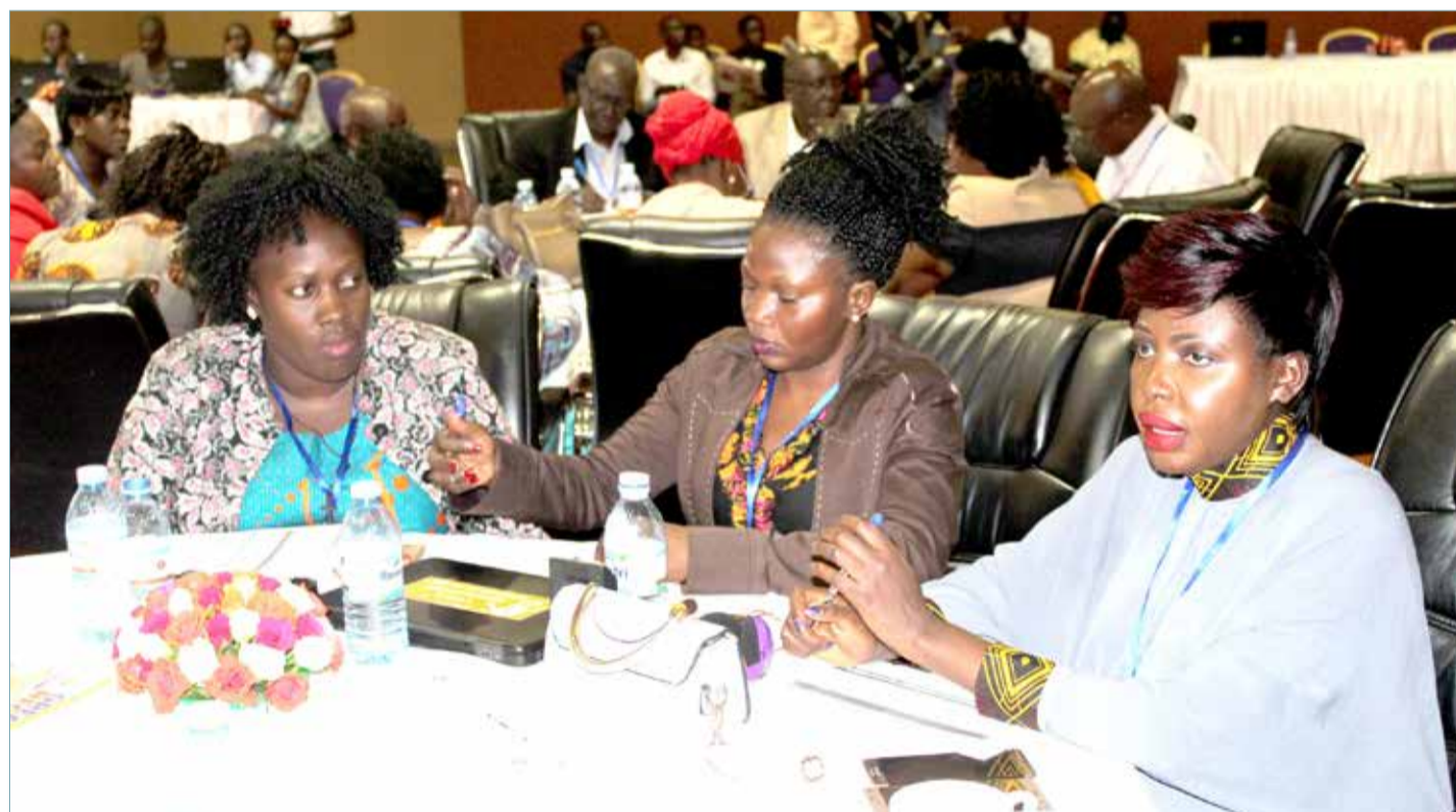
Participants at the conference in Munyonyo

Victims' access to justice is however, still challenging, although domestic violence